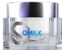
Qmilk Whitening Creme

Ideal fatty acid combination, very rich in antioxidants