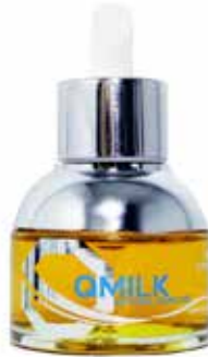
Qmilk Skin Oil

Amino acids stimulate the skin's natural collagen formation